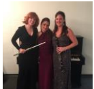
Les Trois Amies

Female Composers You Probably Never Heard of and Why